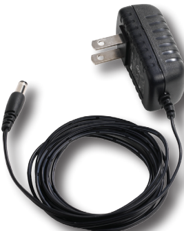
12V DC Power Adaptor