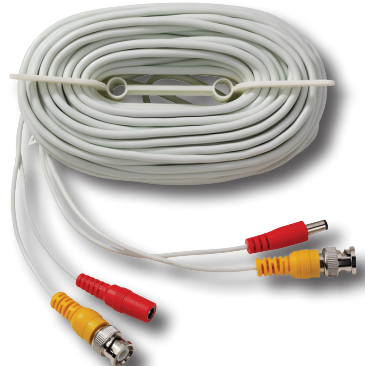
60' BNC Video & DC Power Cable