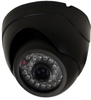
Camera - Ceiling Mounted

Select the position for the camera and secure the camera mounting bracket. Feed the camera cable through the bracket and rotate camera housing onto bracket until secure. Adjust camera to the proper view angle. Make sure the lens is upright relative to the subject by making sure arrow molded into camera faces up. See "Camera Orientation" Info box. Run cable from camera to DVR location. See Information box below on "Longer Cable Runs".