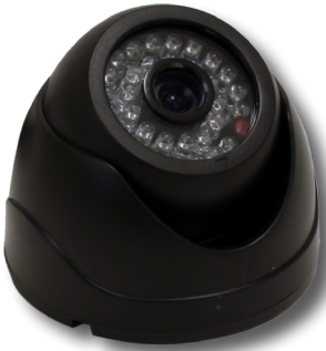
PRO-CMD600 600 TVL Camera with Mounting Hardware